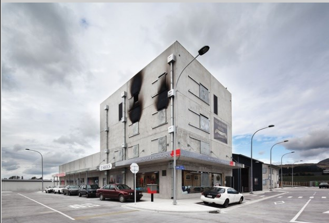
National Training Centre City Street

The programme will be conducted by experienced professional fire officers using various enclosures, props and scenarios and has been designed to offer participants an experience that is as close to the real thing as possible. Don't just read about it in textbooks - feel the heat and see the smoke for yourself!