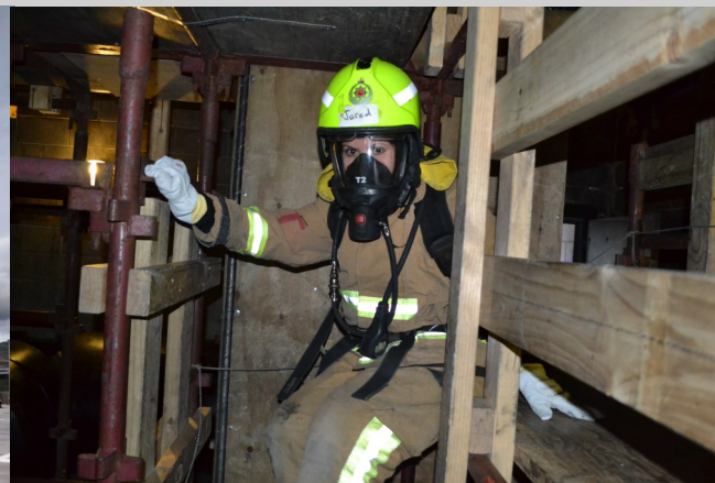
Fire Engineer completing a S&R exercise

A statement of attendance will be issued to the participants on completion of the programme, for the purposes of recording continuing professional development (CPD) undertaken.